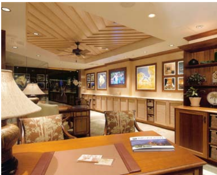
Hilton Grand Vacation Club - Ocean Tower of the Hilton Waikoloa Resort. A prestigious ASID Design Award was presented to Susan J. Moss ASID, IIDA for this activator sales office for resort time-shares. The interior features built-in, flat screen TV's, set in custom cabinets and millwork, with sales images viewed on backlit projection screens. The photos draw people into the office from the Ocean Tower tram terminal. Situated under a unique angled plank ceiling, the furnishings are upholstered in durable textiles with tropical images.